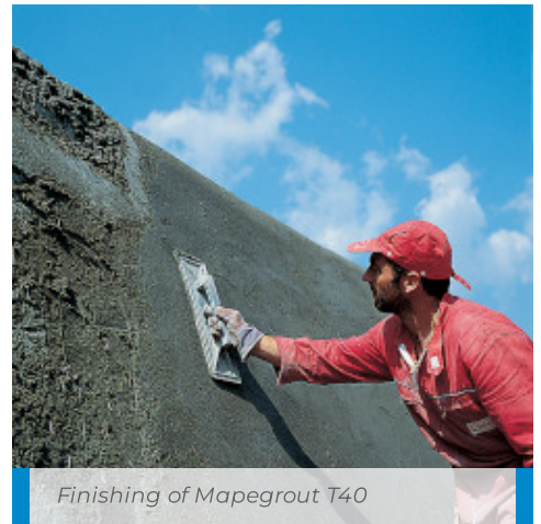
Finishing of Mapegrout T40