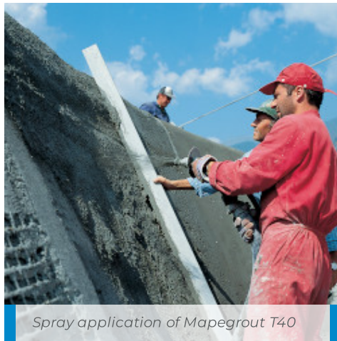
Spray application of Mapegrout T40