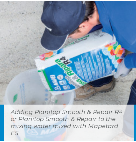
Adding Planitop Smooth & Repair R4 or Planitop Smooth & Repair to the mixing water mixed with Mapetard ES