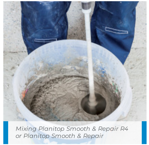
Mixing Planitop Smooth & Repair R4 or Planitop Smooth & Repair