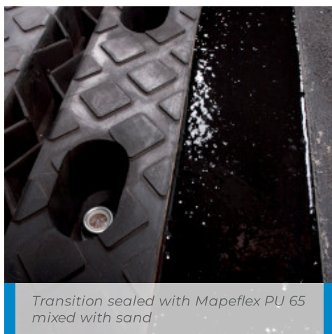
Transition sealed with Mapeflex PU 65 mixed with sand