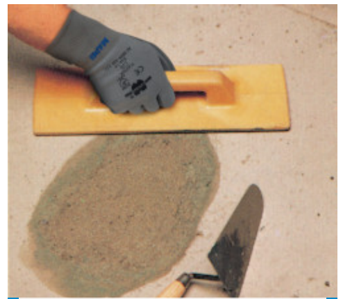
Floor patching: final smoothing