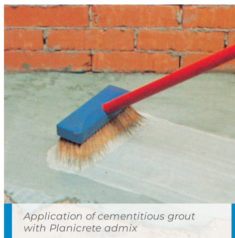
Application of cementitious grout with Planicrete admix