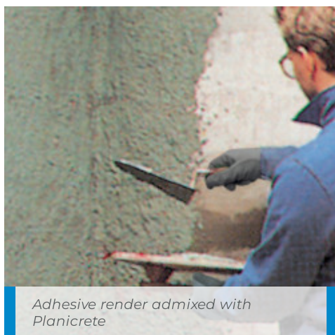
Adhesive render admixed with Planicrete

The setting time for mixes containing Planicrete as an admix does not differ significantly from normal mixes. Workability is usually slightly longer.