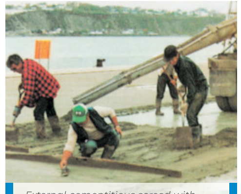
External cementitious screed with Planicrete admix - Vieux Port, Quebec, Canada