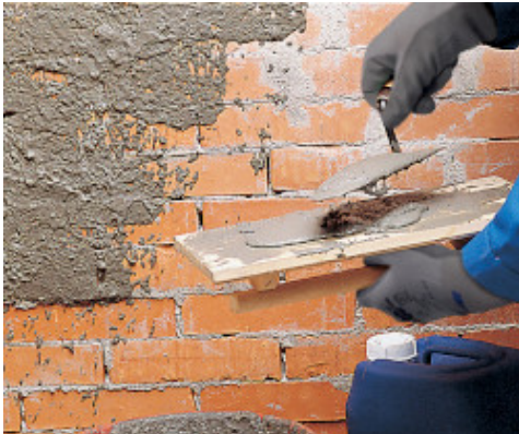
Base-keying mortar layer with Planicrete admix