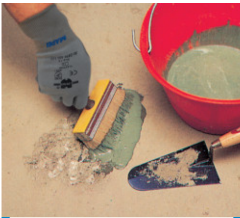
Floor patching: application of slurry