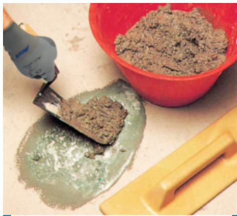
Floor patching: application of mortar