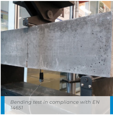
Bending test in compliance with EN 14651