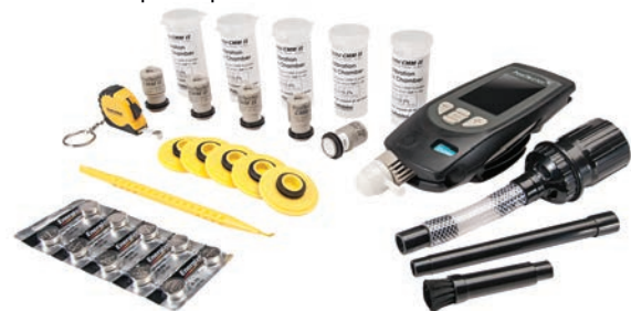
PosiTector CMM IS Pro Kit includes the PosiTector DPM Advanced

Replacement chambers, salt solutions, tools, caps and fins are available upon request