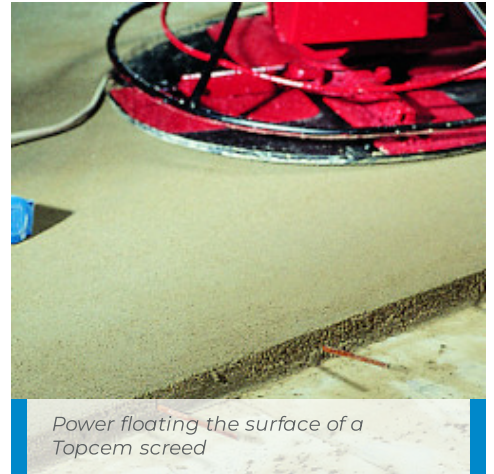
Power floating the surface of a Topcem screed