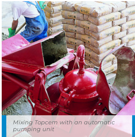
Mixing Topcem with an automatic pumping unit