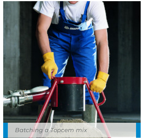
Batching a Topcem mix