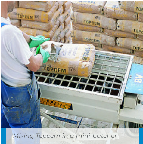
Mixing Topcem in a mini-batcher