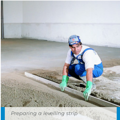
Preparing a levelling strip